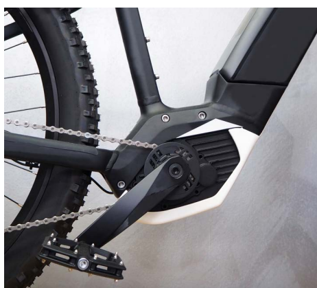
Delrin® used in e-bikes

Delrin® RA511CPE base polymer is produced using 100% bio-feedstock from waste, accredited through the International Sustainability and Carbon Certification (ISCC) mass balance certification system. It delivers state-of-the-art low VOC technology and top-class mechanical properties with reduced lifecycle greenhouse gas emissions and lower fossil resource use.